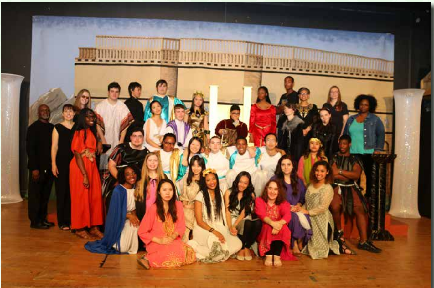
Cast and Crew photo from the Esther Drama production -in collaboration with the Music Department