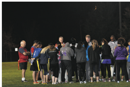
Quick prayer before the start of the games.